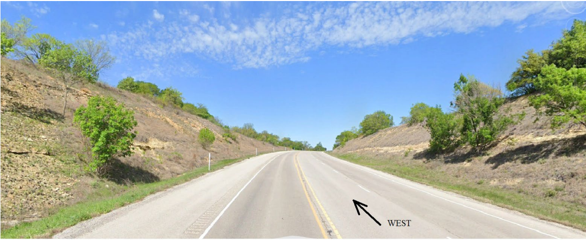
STOP 6, LARGE ROAD CUT NEAR TOP OF HILL. SANDSTONE LAYERS EXPOSED. About 2 miles past Vineyard.